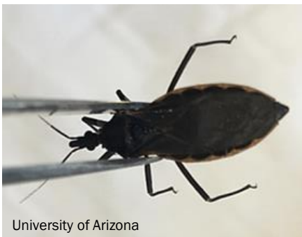
University of Arizona

What: parasitic disease caused by Trypanosoma cruzi