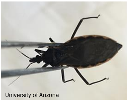
University of Arizona

What: parasitic disease caused by Trypanosoma cruzi