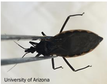
University of Arizona

What: parasitic disease caused by Trypanosoma cruzi